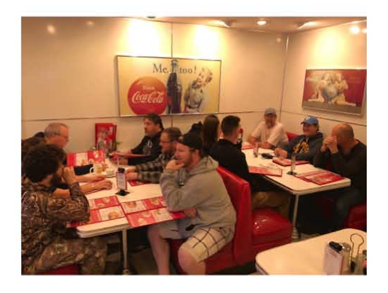
Warming up at Ruby's