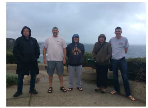
Early Birds at Little Corona

Driving toward Little Corona beach at around 6 a.m., dark clouds began to gather, some droplets began to arrive, and then whoosh the wind and the waves crashing...standing around for everyone to arrive, someone said, "Would I be wimping out if I didn't go in?" The chorus back, "NO"! The morning was not lost however as we all repaired to Ruby's and enjoyed a nice breakfast meal and good company, all 13 divers and 1 non-diver attending. Hope to see you in at Moss St Cove in Laguna on March 15th (7 a.m. rally time).